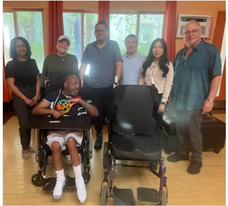
CP Rehab Team, Cooper Union Students, and People We Support Working Together

Building on their award-winning invention of an automatic wheelchair brake for manual chairs, the student team from Cooper Union visited CP Unlimited's Caldwell residence for a round of field testing and demonstration with our Rehabilitation team and some of the people we support who can use the device.