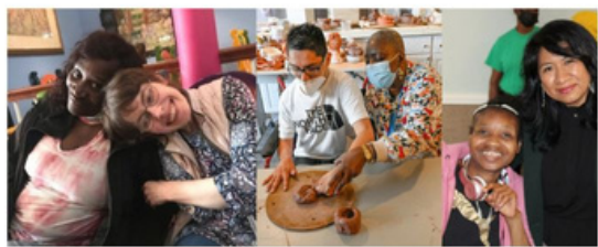
DSP's Want The New York Dream

Join providers to demand additional funding and support for DSPs and advocate for the “Traveling with Dignity” Act