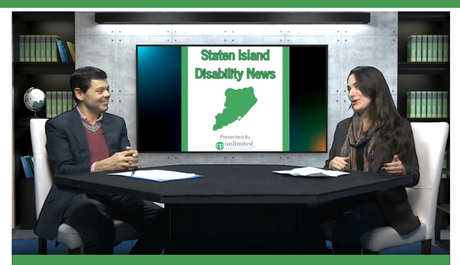
Episode 2: Maintaining Mobility and Movement

This second episode explores the topics of Mobility and Movement, as it connects to people with intellectual and developmental disabilitiesspecifically, how do you get people who in many ways have limited movement, to perform everyday tasks? What are innovative approaches to empowering and strengthening both the body and spirit? What we hope is that by the end of this episode, you will come away more confident to grow both perspectives and muscles.